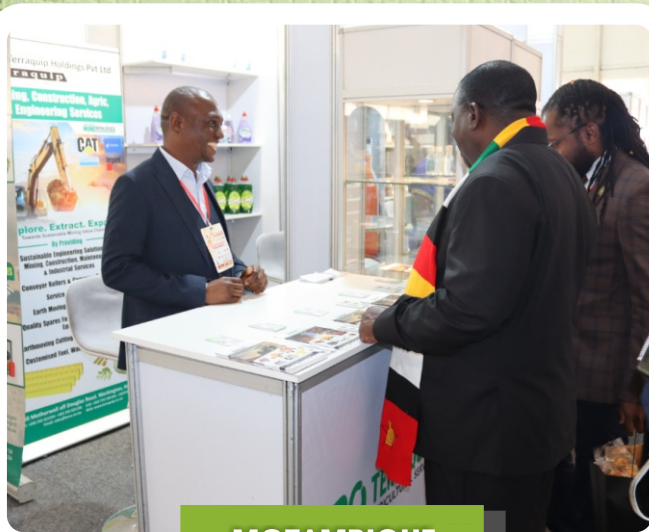
MOZAMBIQUE IntL Trade Fair 2022