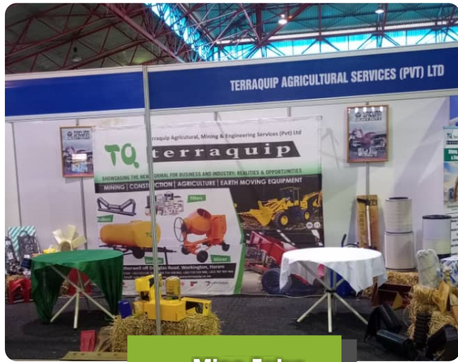
Mine Entra 2022